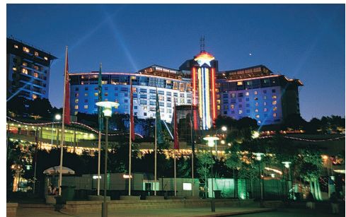
The Star – Sydney