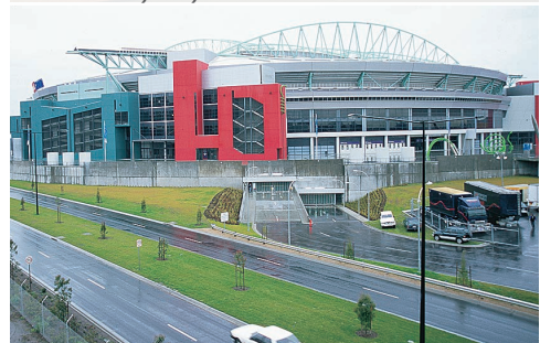
Etihad Stadium – Melbourne